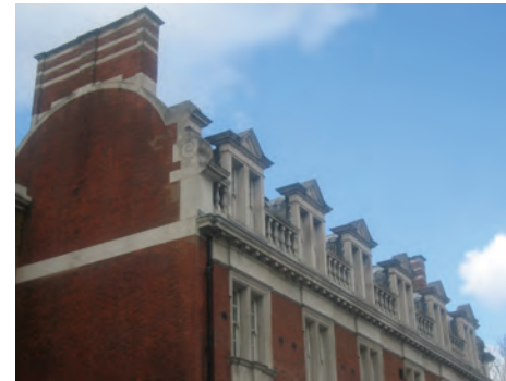
Look out for the horse stables behind Bow Road police station, built in 1903.