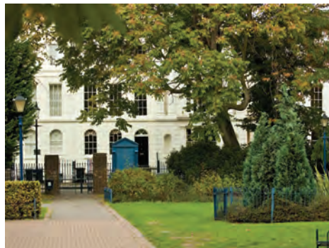
Stand in the centre of Tredegar Square to get the best view of all four terraces.