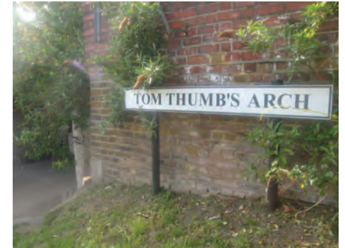
Duck as you head through Tom Thumb's Arch, under the Great Eastern Railway.