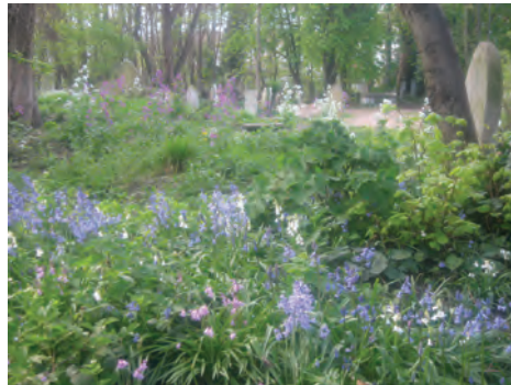
Listen to the lively birdsong and enjoy the wild flowers in the Cemetery.