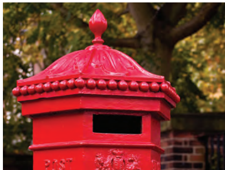
Post a letter in the early Victorian pillar-box in Tredegar Square.