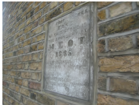
Find the old boundary stone for Mile End Old Town at 20 Morgan Street.