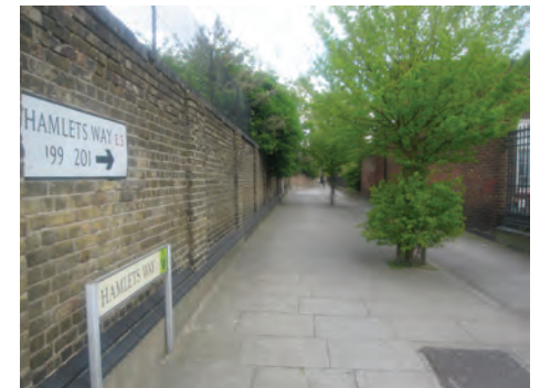
Stroll along Hamlets Way, a green walkway beside the Cemetery.