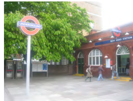
Use this as a route to reach Bow Road tube station.