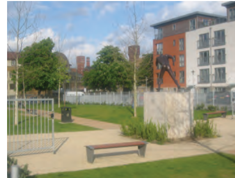
Catch a glimpse of the old Bryant & May match factory from Mostyn Grove gardens.