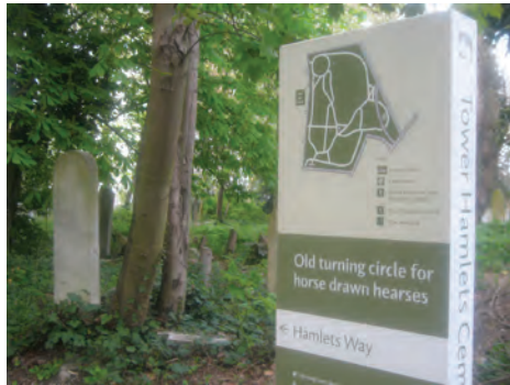
Pop into the Soane Centre to find out about bat walks, nature walks and historical tours.